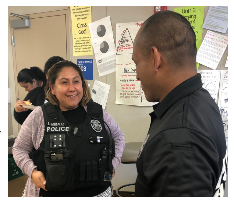
"Thank you for opening a communication channel with the police department." (Original quote in Spanish) - Parent

Lastly, they convened Hate Crime Network meetings with 49 individuals for the purpose of fostering a safe and inclusive community, to strengthen collaboration and increase reporting of hate crimes and incidents.